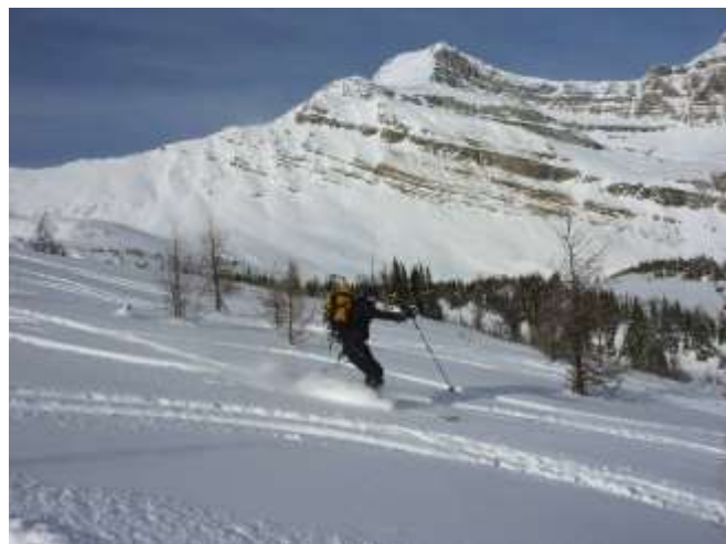
[above Hidden Lake]