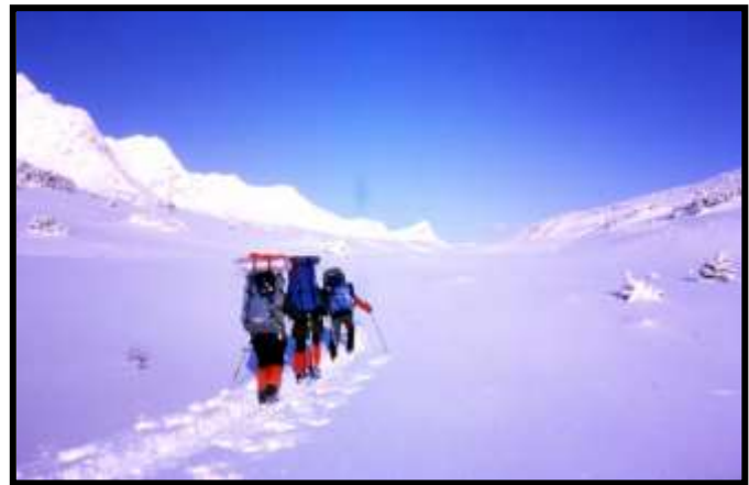
[Jonas Pass, on the way to Jasper]