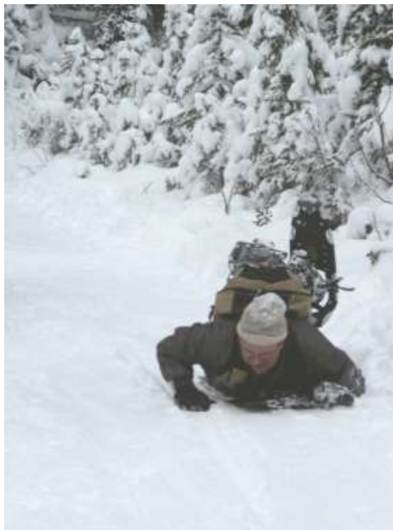
[tribulations while snowshoeing]

Ski poles are suggested for balance and help with propulsion.