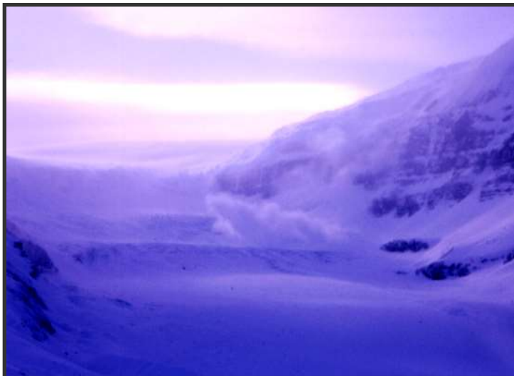
(avalanche off Snowdome)