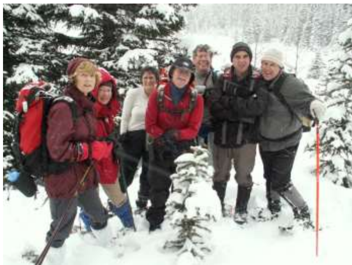
[Playing around near Elephant Rocks]