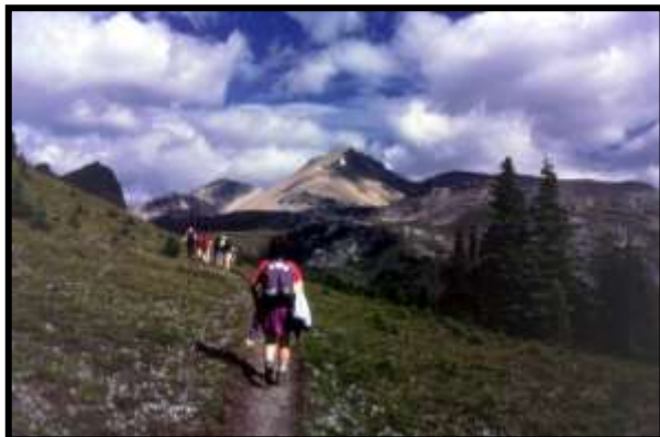
[Dolomite Pass Trail, TL 2 at this point]