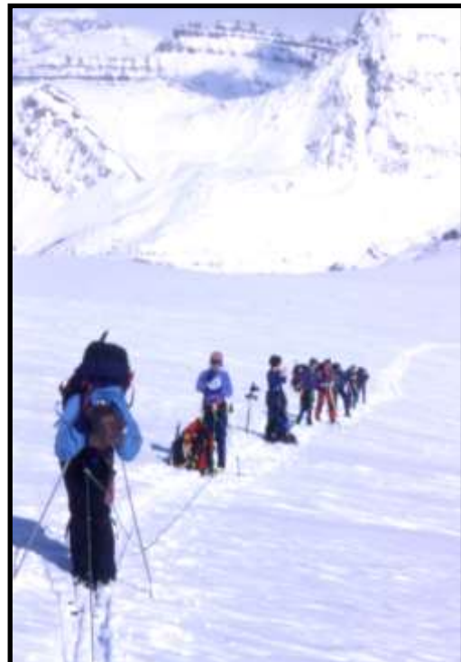
[ascending Mt. Rhondda above Bow Hut]

Difficulty numbers range from 6 to 9 as determined by Coordinators considering varying difficulty factors.