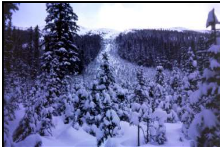
[avalanche track on Boom Lake trail]

Avalanches are a concern when traveling in avalanche terrain. Snowpack instability can be difficult to judge even for experts. This is especially true above treeline where wind plays an important role in forming dangerous slabs. Route finding skills are required to avoid avalanche terrain as much as possible. Participants should take an avalanche awareness course, be familiar with the use of avalanche equipment and do an annual transceiver practice. (see the Avalanche Risk Management Policy )