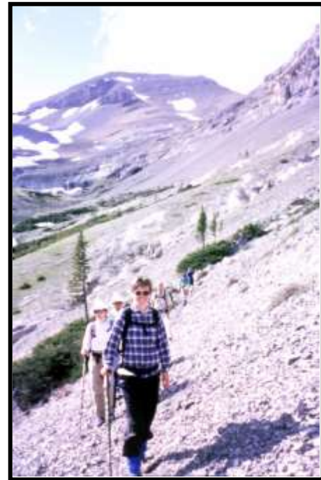
[Glasgow-Banded Traverse, OT 5 at this point]