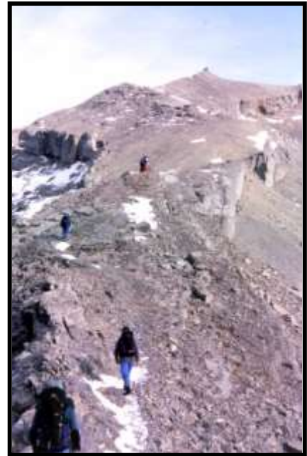
[Mt Burke, TL 3]