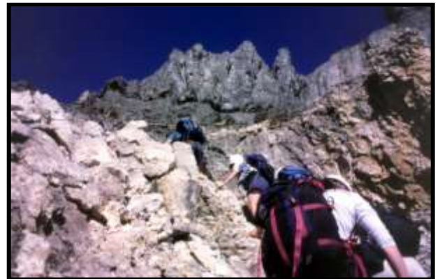
[scrambling on Mt Chephren, Aug /98 SC 7]