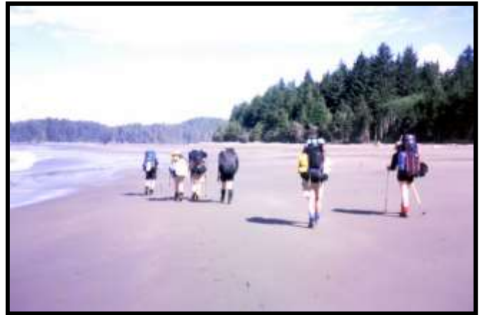
[West Coast Trail, OT 1 at this point]