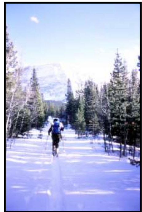
[Fitzsimmons Creek, Mt Armstrong ]

Difficulty numbers range from 1 to 6 as determined by Coordinators considering varying difficulty factors.