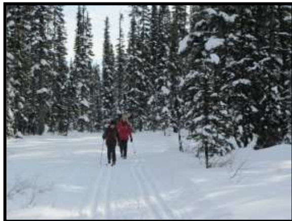
[track-set skiing, Telemark Trail, Lake Louise]

Difficulty numbers range from 1 to 5 which correspond roughly to the "easy, easy intermediate, intermediate, hard intermediate, and difficult" ratings of a popular guidebook "Kananaskis Country Ski Trails" by Gillean Daffern.