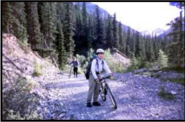
[Glasgow-Banded traverse bike approach,]

The RMRA does not have a formal rating system for Mountain Biking but the terms "Easy, Intermediate, and Difficult" could be used. Hiking Trip Categories of Trail and Off-Trail, Difficulty Number, and Endurance Indicators of distance and elevations gain could also be used to rate Mountain Bike trips.