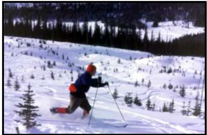
[Rummel Lake cutblocks]

Difficulty numbers range from 1 to 6 as determined by Coordinators considering varying difficulty factors.